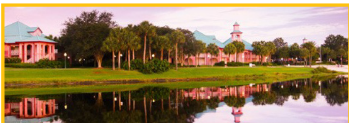
Disney's Caribbean Beach Resort